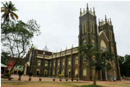
St. Andrew's Basilica, Arthunka